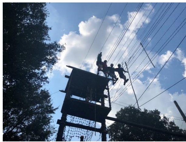
Men's Team Building at the UNCC Ropes Course