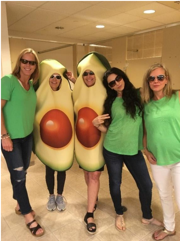
The Now Famous Avocado Dancers